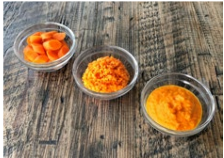
Food textures: Chopped, ground, and pureed