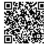
Tricare Prime Travel Benefit

Public Transportation is a great option for many after a stroke.