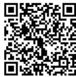
Veterans Transportation Program (VTP)