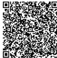
Moving Forward After a Stroke: Aphasia Companion Booklet