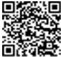
Stroke Rehab Clinical Practice Guideline

Scan the QR Code with your smartphone for additional resources